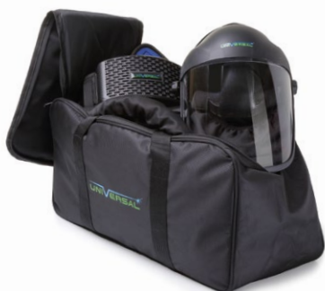
Grinding screen with Momentum Kit Bag Complete – KP100-000-005-000