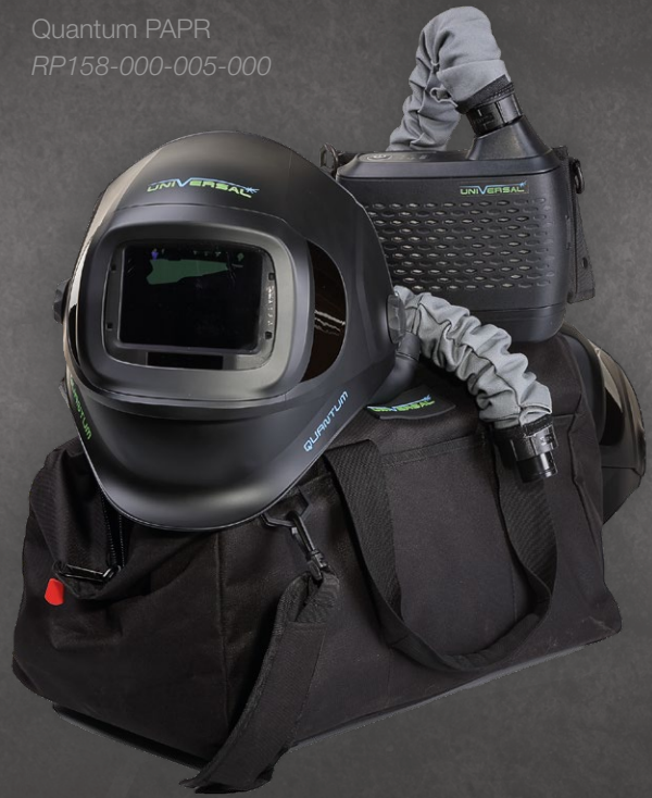
Quantum PAPR RP158-000-005-000

The Quantum Air PAPR system combined with the Quantum helmet, offers heavy duty protection from welding fume and grinding dust. A large viewing/grinding visor window allows the welder to remain fully protected without exposure to the face, whilst also giving excellent field of view.