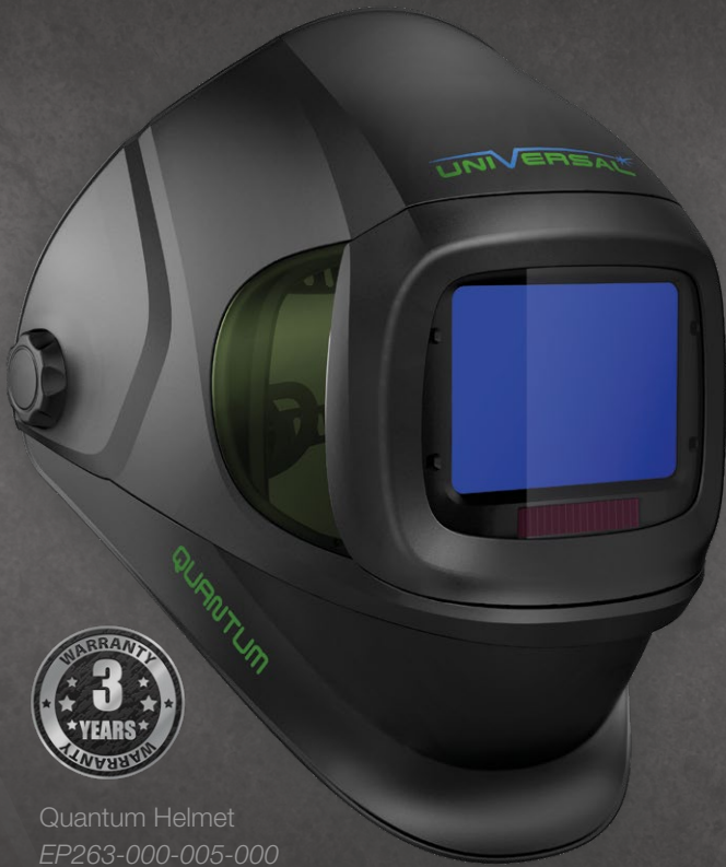
Quantum Helmet EP263-000-005-000

The Combined Welding & Grinding Solution